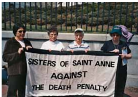
Good Friday Silent Vigil against the Death Penalty and All Violence, State House Boston, MA, April 10, 2009

Another effective alliance: we donate to The Massachusetts Immigrant and Refugee Advocacy Coalition (MIRA). This coalition keeps immigrants and people working with them informed and also advocates for the immigrants.