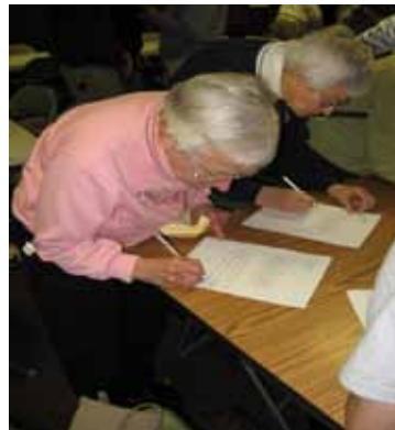
The sisters are very much involved in social justice issues, immigration reform being one of them.