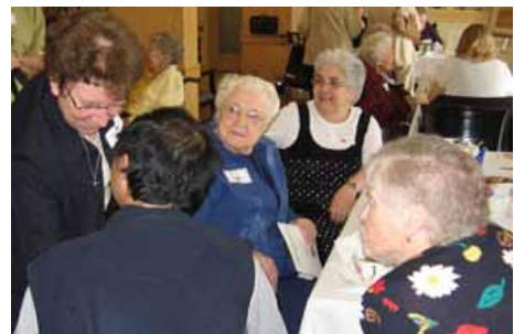
Above: at Mount St. Mary's Hospital at the annual Tulip Tea