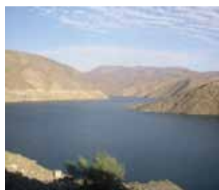
The right to water is a fundamental right.