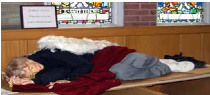
An Angel of the street

A number of SSA took part in the walk to the legislative buildings on April 4 as a protest against homelessness. As the large crowd made its way through downtown Victoria, banners, placards, songs and chants gave testimony to the need for action to solve the serious problem of lack of affordable housing. This demonstration, coming just before the Provincial election, was the climax after regular “stands” on street corners throughout the year gave the same message. At the legislature a few speeches were made and photos were taken, especially of the “Street Angel”, a figure lying on a blanket at the base of the steps, symbol of all those who live on the streets.