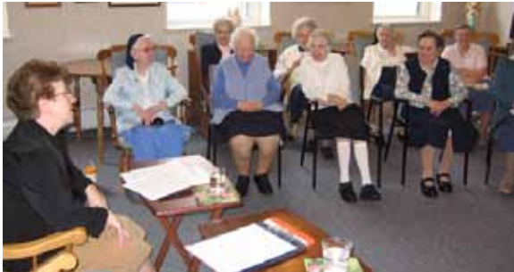
The elderly sisters of the province share their concerns and actions in favour of social justice.